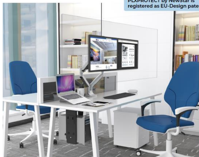
PLXPROTECT by NewStar is registered as EU-Design patent

The screens, unlike alternative solutions, do not take up extra space on the desk. The NS-PLXPROTECT1 is designed to be installed on a desk mount and the NS-PLXPROTECT2 can be mounted on 2 separate arms, gas-sprung arms, a crossbar and/ or a double monitor arm. Fun fact; the screens can also be used as a memo board for your to do lists and notes, using a whiteboard marker.