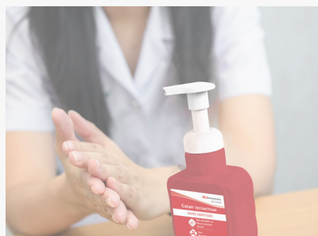
HEALTHCARE/ LIFE SCIENCE