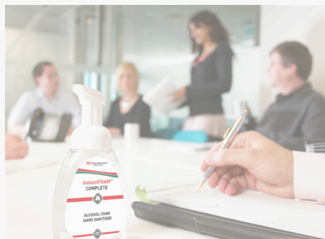
COMMUNAL & PUBLIC AREAS